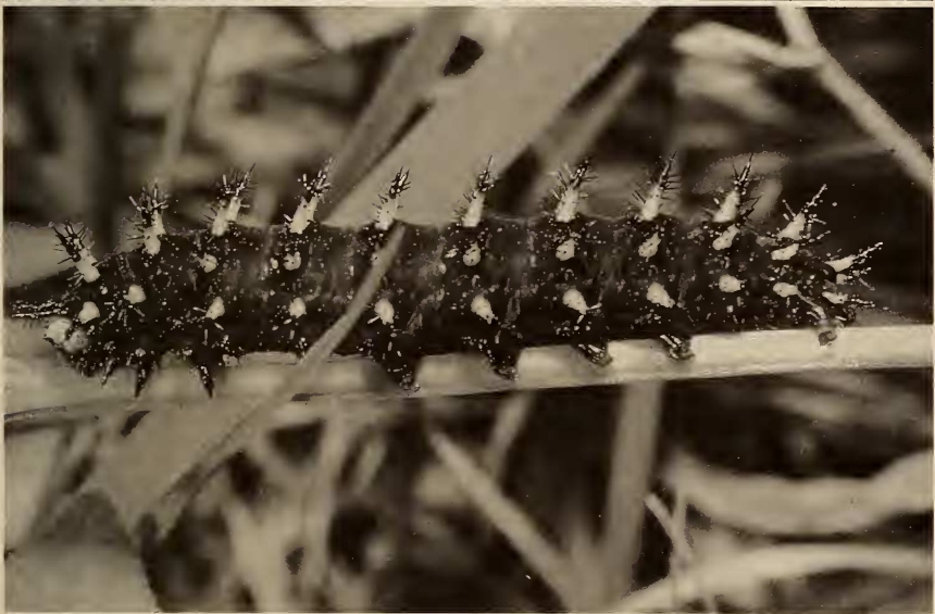
FIGS. 1-2. Continued.

sumed by a greater diversity of bird species (they constitute an important part of the diet of flycatchers, warblers, vireos, chickadees, and a number of other passerines) whereas butterflies generally are consumed only by larger, more agile birds, so a more general resemblance